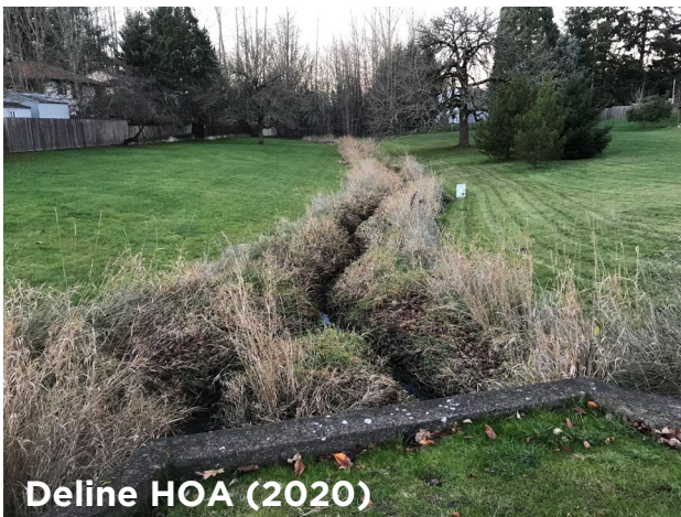
Deline HOA (2020)