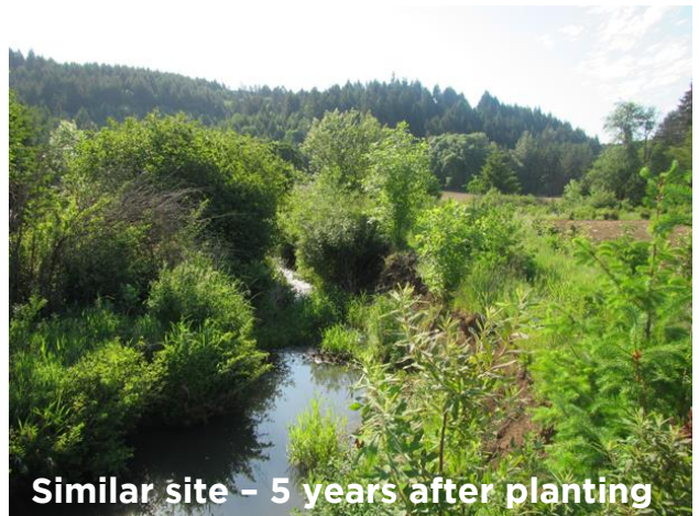
Similar site - 5 years after planting

A similar restoration project was recently undertaken by a Washington County resident along White Creek. Invasive plants, like reed canary grass, had overtaken the creek's banks leading to erosion caused by shallow plant roots. After several years of site preparation, native wetland plants and trees were planted to create a more diverse, healthy habitat for wildlife and water quality (right).