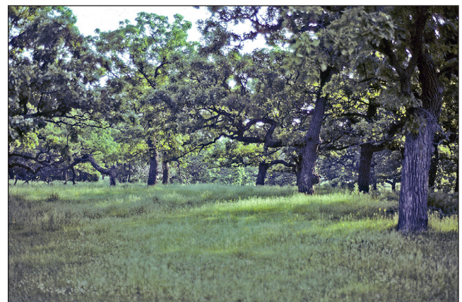
This morainal ridge in Waukesha County supports a remnant oak opening. The dominant trees are large open-grown bur oaks, with scattered white oak and shagbark hickory also present. A long history of grazing has maintained savanna structure, but the understory is now composed almost entirely of nonnative cool season grasses. Southeast Glacial Plains Ecological Landscape.