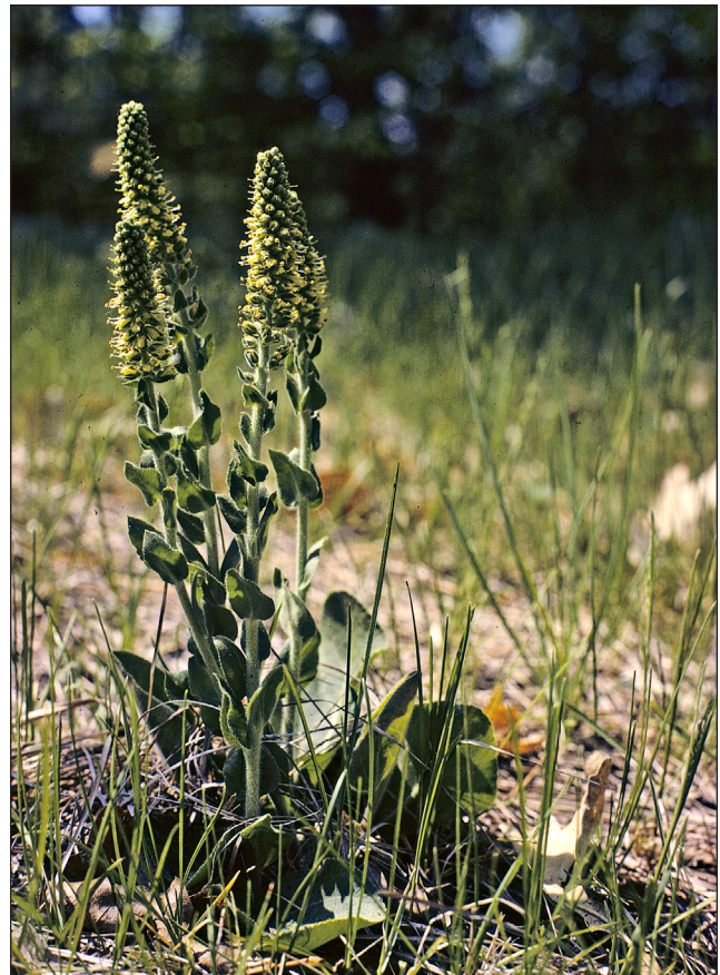
One of the native plants adapted to the filtered shade and patchy canopy conditions of the oak opening is the globally rare kitten-tails.

A relatively small number of plants and animals reach their optimal abundance in the somewhat ecotonal Oak Openings. Some of the better known examples include kitten-tails ( Besseyia bullii ), yellow giant hyssop ( Agastache nepetoides ), cream gentian ( Gentiana alba ), smooth phlox ( Phlox glaberrima ), white camas ( Zigadenus elegans var. glaucus ), and purple milkweed ( Asclepias purpurascens ), all of which are now rare in Wisconsin. Among other plants that are known to occur in Oak Openings but that are either too rare to be useful as indicators of any particular community assemblage or structure, or which have been more strongly linked to other natural communities, are woolly milkweed ( Asclepias lanuginosa ), great Indian-plantain ( Arnoglossum reniforme ), wild hyacinth ( Camassia scilloides ), violet bush-clover ( Lespedeza violacea ), slender bush-clover ( L. virginica ), and one-flowered broom-rape ( Orobanche uniflora ).