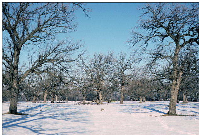
Open-grown bur oaks dominate this remnant oak opening in western Waukesha County. Grazing has maintained savanna stand structure, but the understory is now dominated almost entirely by nonnative plants. Southeast Glacial Plains Ecological Landscape.

Oak Opening restoration and management will likely be most successful where other natural communities belonging to the mosaic of fire-dependent vegetation comprising the oak ecosystem are also present (such as oak woodland and