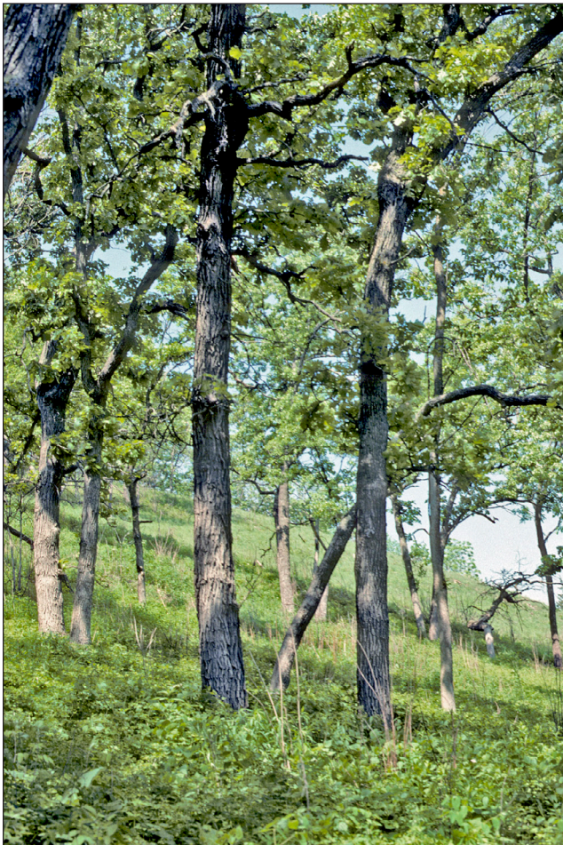
This white oak-red oak-black oak woodland has been "thinned from below," and several prescribed burns have reduced the heavy shade created by the previously dense understory of deciduous shrubs and saplings. Legumes, composites, and other light-demanding herbs are now thriving in the understory. Rush Creek State Natural Area, Crawford County, Western Coulees and Ridges Ecological Landscape.

Some members of the Oak Woodland flora are thought to belong to genera or families that are also common in other communities in the oak ecosystem group but represented by a different set of species (belonging to genera that include as members composites, grasses, legumes, mints, and snapdragons). Examples of species observed in and thought to be possibly representative of oak woodland environments include figwort giant hyssop ( Agastache scrophulariaefolia ), poke milkweed ( Asclepias exaltata ), American bellflower ( Campanula americana ), wood thistle ( Cirsium altissimum ), long-bracted green orchid ( Coeloglossum viride ), bracted tick-trefoil ( Desmodium cuspidatum ), purple Joe-Pye-weed ( Eupatorium purpureum ), bottlebrush grass ( Elymus hystrix ), forest bedstraw ( Galium circaezans ), broad-leaved panic grass ( Dichanthelium latifolium ), Solomon's-seal ( Polygonatum biflorum ), Short's aster ( Symphotrichum shortii ), and yellow-pimpernel ( Taenidia integerrima ).