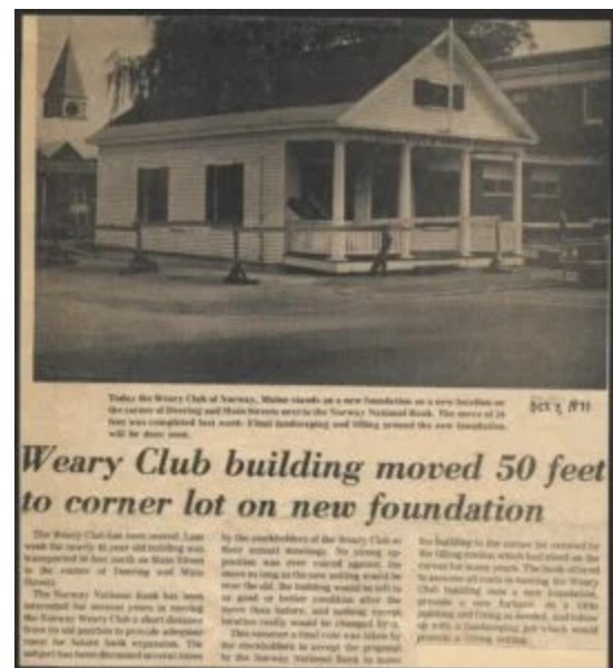
A big event of the Weary Club's legacy was a 50-foot move along Main Street in the name of progress.