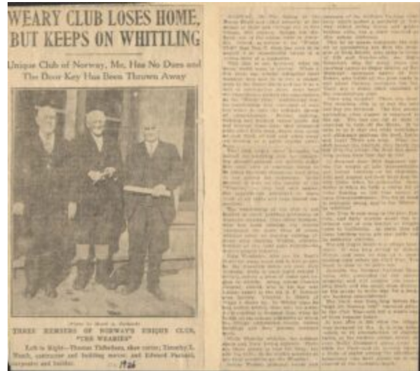
A newspaper primer on the Weary Club's early history.