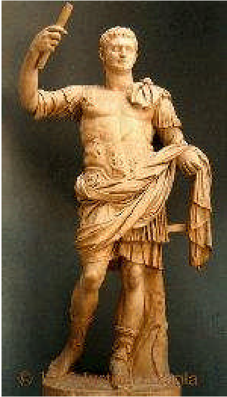
Titus Flavius Domitianus Emperor – 81-96 A.D.