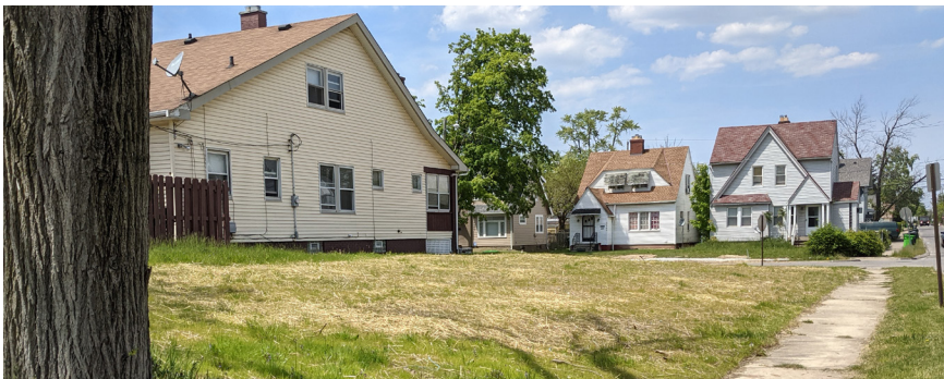
A Potential Infill Lot in a First Suburb