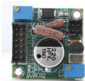
Upon start-up, two signals are internally pulled up to 5 Vdc. Onboard electronics switch between the two when pulses are detected on the Step input.

Engineers at Mechatronic Techniques , Plano, Tex., recently designed a motor-powered stopper to replace pneumatic and solenoid stoppers on some custom conveyors. The stoppers extend into the conveyor's material stream to halt the flow of trays containing parts for assembly. When workstations downstream are ready, the stoppers retract and the flow of trays resumes. Previous pneumatic stoppers were inefficient and loud, and solenoid stoppers were often underpowered.