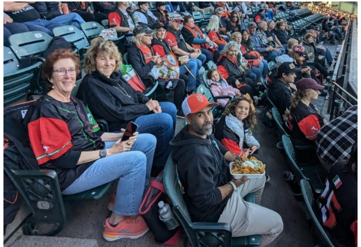
The IACC had 45 members and friends attend the San Francisco Giant's Italian Heritage Night on Tuesday, June 17 against the Cleveland Guardians. Everyone was treated to an Italian Jersey. Big thanks to Cypress Lawn for the trolley ride. More photos on page 5.

But there are a few changes that I believe are important to bring to our member's attention. One is a provision that each member of the Club should make an effort to contribute at least 20 hours of volunteer time to Club activities. Those hours can include simply attending a General Meeting (counting for three hours), serving in office or on a committee, helping in the setting up or cleaning up after an event, running a bocce league or tournament, or helping behind the scenes with any event or activity that the Club holds. Honorary and Lifetime members would be exempt from this provision.