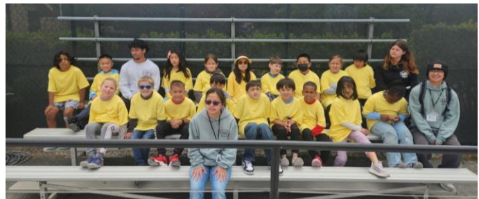
Orange Park Second and Third Graders