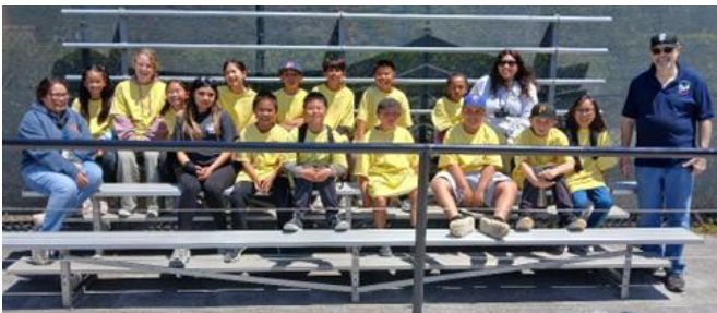
Ponderosa Fifth and Sixth Graders