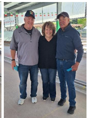
3 rd Place