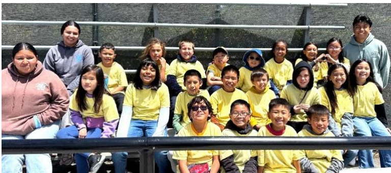
Ponderosa 2 nd & 3 rd Graders

Thanks to all our IACC volunteers for teaching the youngsters Bocce Ball.