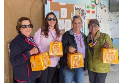
3 rd Place – Shooting Stars