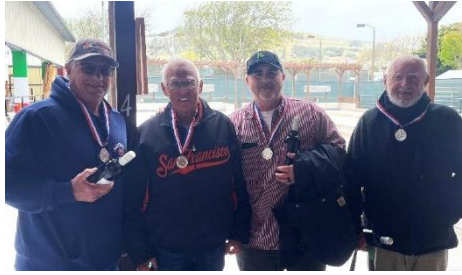
2 nd Place – The Eagles