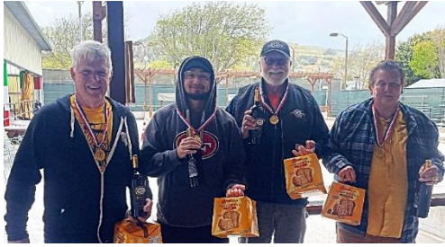
1 st Place – Rolling Thunder