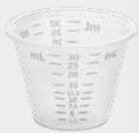
An entire medicine cup