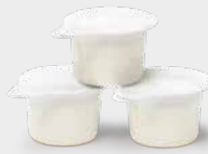
3 coffee creamers