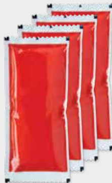
4 packs of ketchup