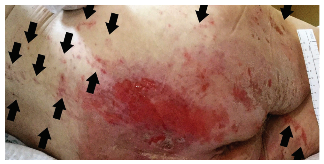
Photo on first encounter with this patient. (Arrows in the photos denote blister formation)

Lesson 1: If you believe the issue is from moisture and you are treating it as if it was from moisture, but it is not responding like a moisture lesion, it is most likely not moisture.