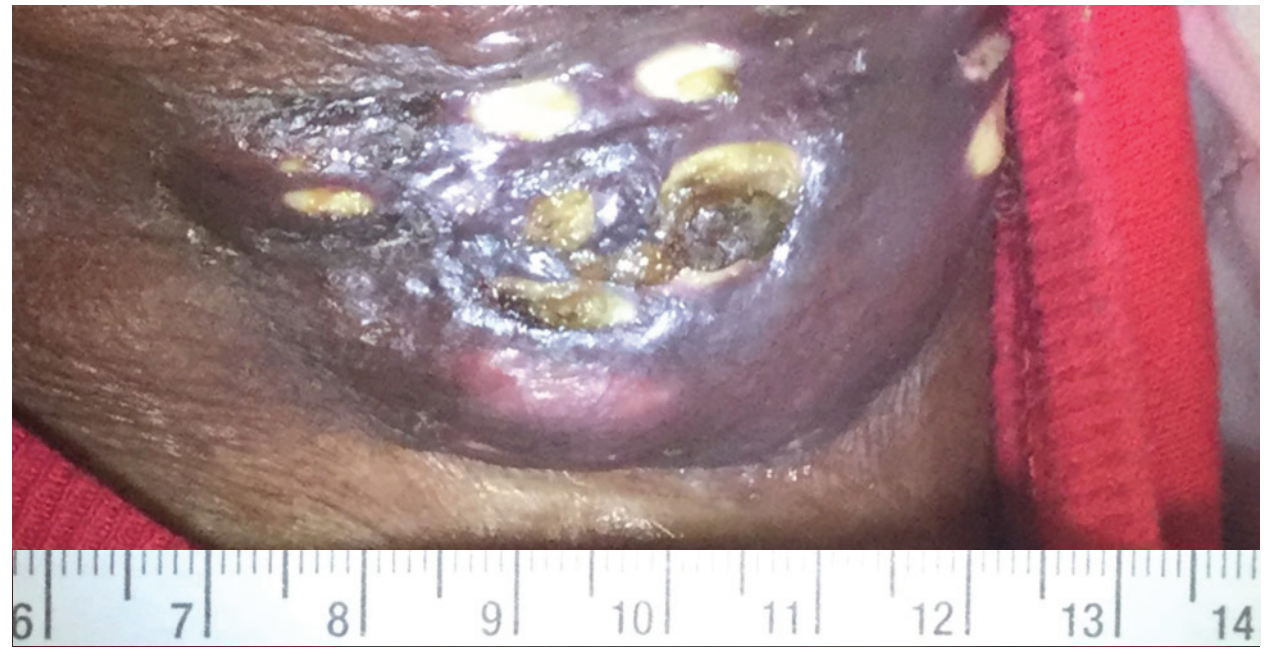
Photo from second encounter (week 2)

Considering the patient's history, the diagnosis is partially revealed. The final piece of evidence would be a fine-needle aspiration biopsy of the abnormal lymph node. If the aspirate cytology shows a well-formed epithelioid granuloma and presence of caseous necrosis, it is almost inarguable that the lymph node is positive for MCL and needs to be treated as MCL.