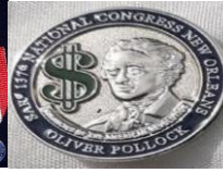
Oliver Pollock 137 th Congress Lapel Pin $25

Medal Sets/Pins will be sold at Leadership Conferences, NSSAR Congress's and online at the Southern District SAR Website https://alssar.org/southerndistrict