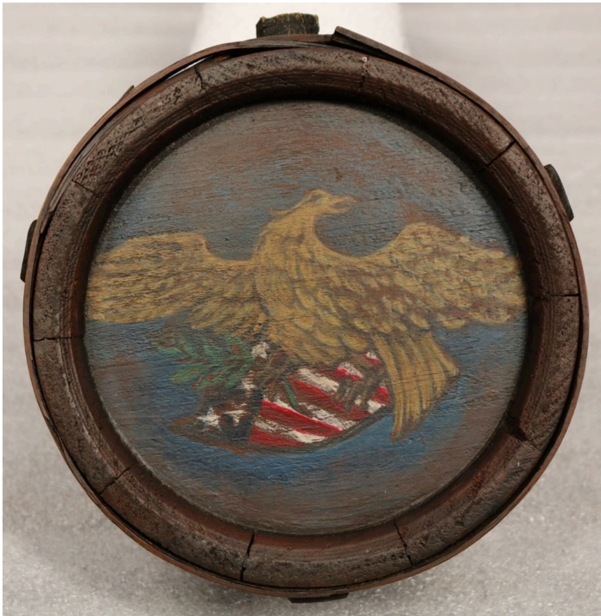
American Revolution Era Canteen with Later Federal Eagle Painting SAR Museum Board Purchase