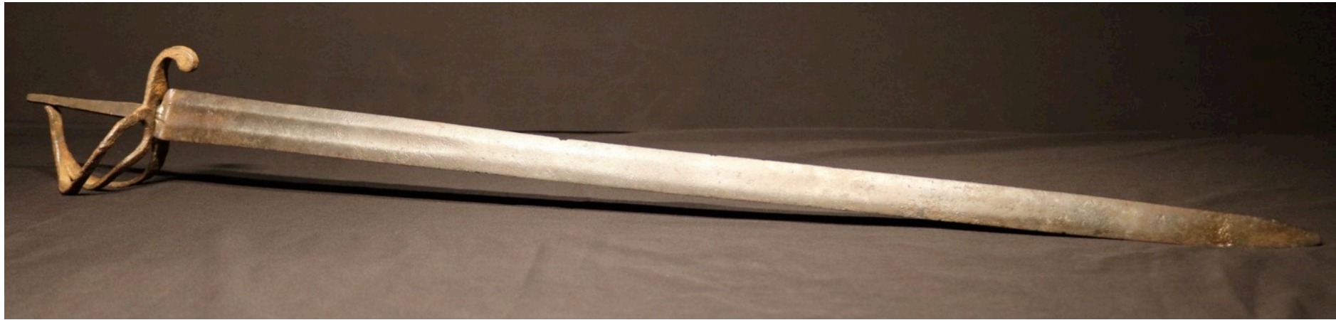
Revolutionary War Sword Recovered at Kings Mountain Battle Site Donated by the Kings Mountain Chapter TNSSAR