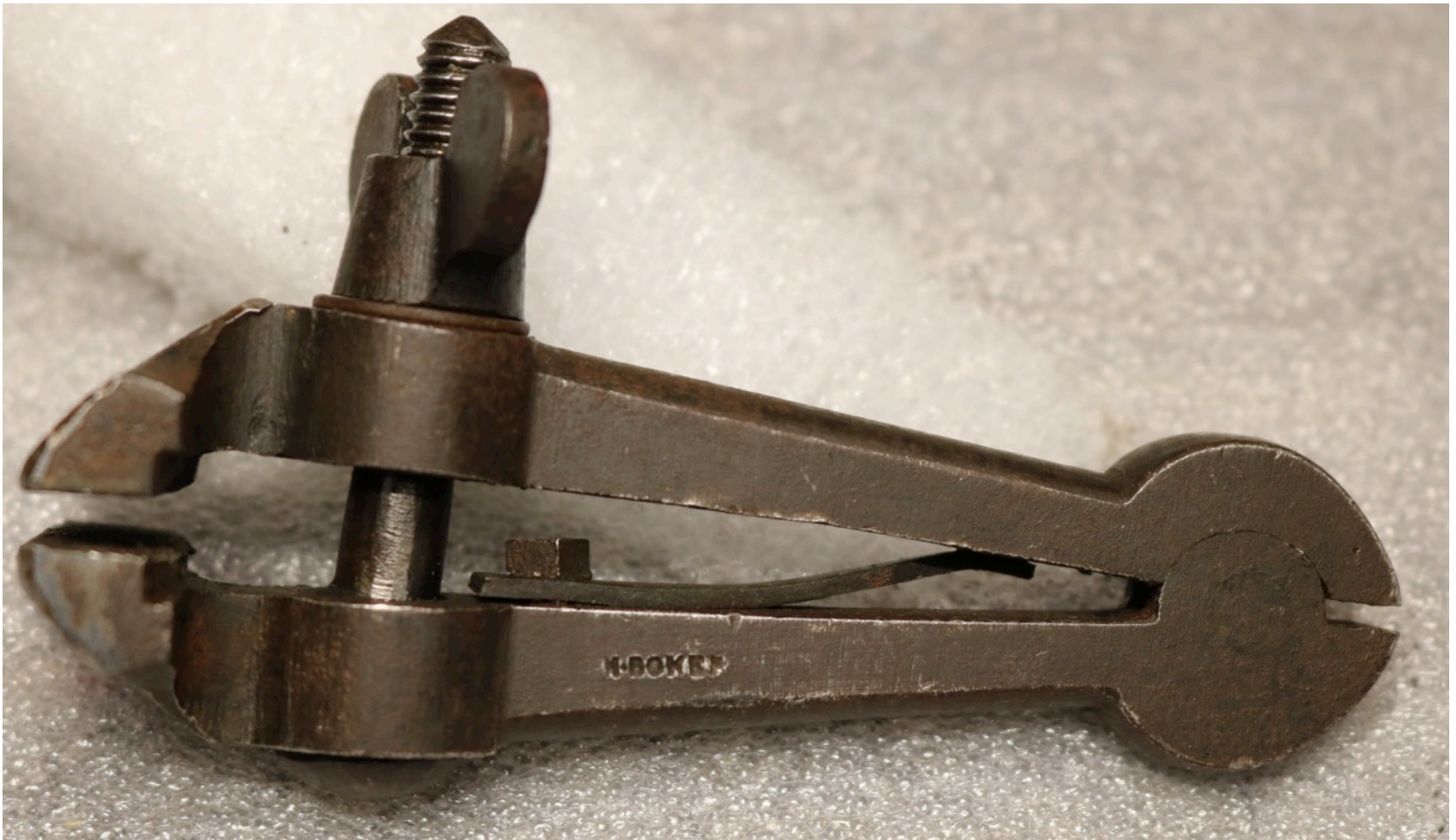
American Revolution Era Gun Tool SAR Museum Board Purchase