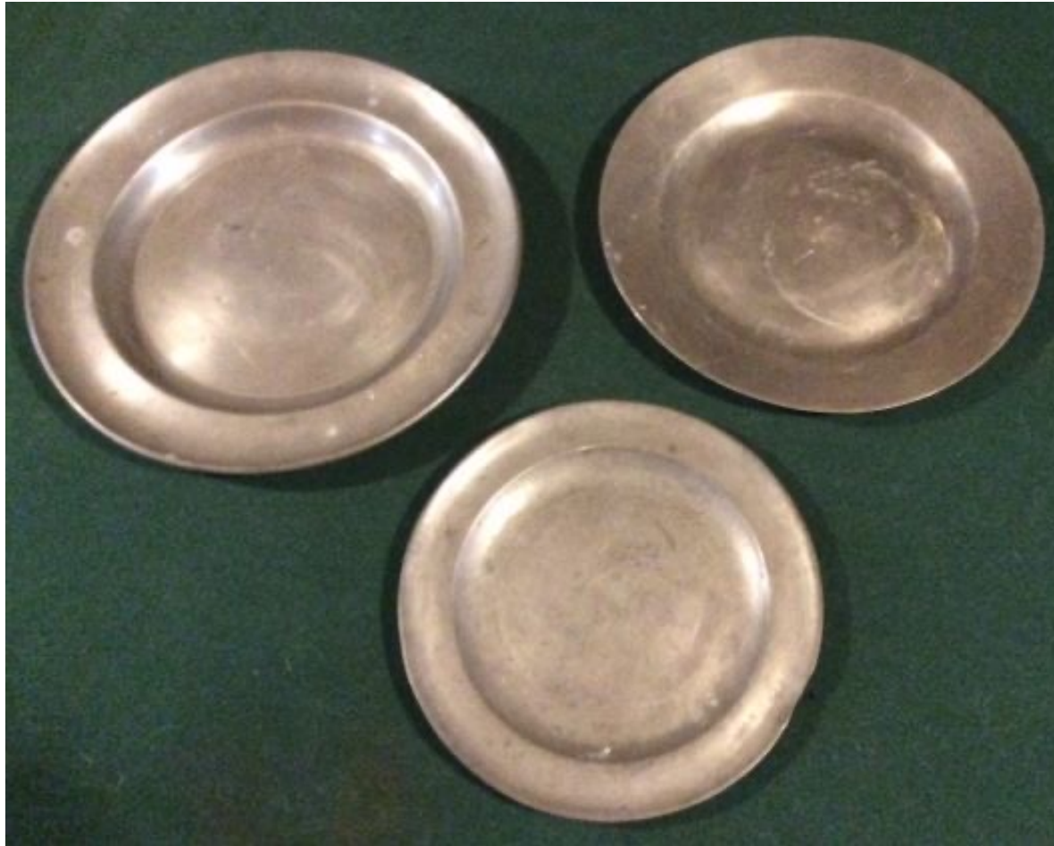
American Revolution Era Pewter Plates SAR Museum Board Purchase