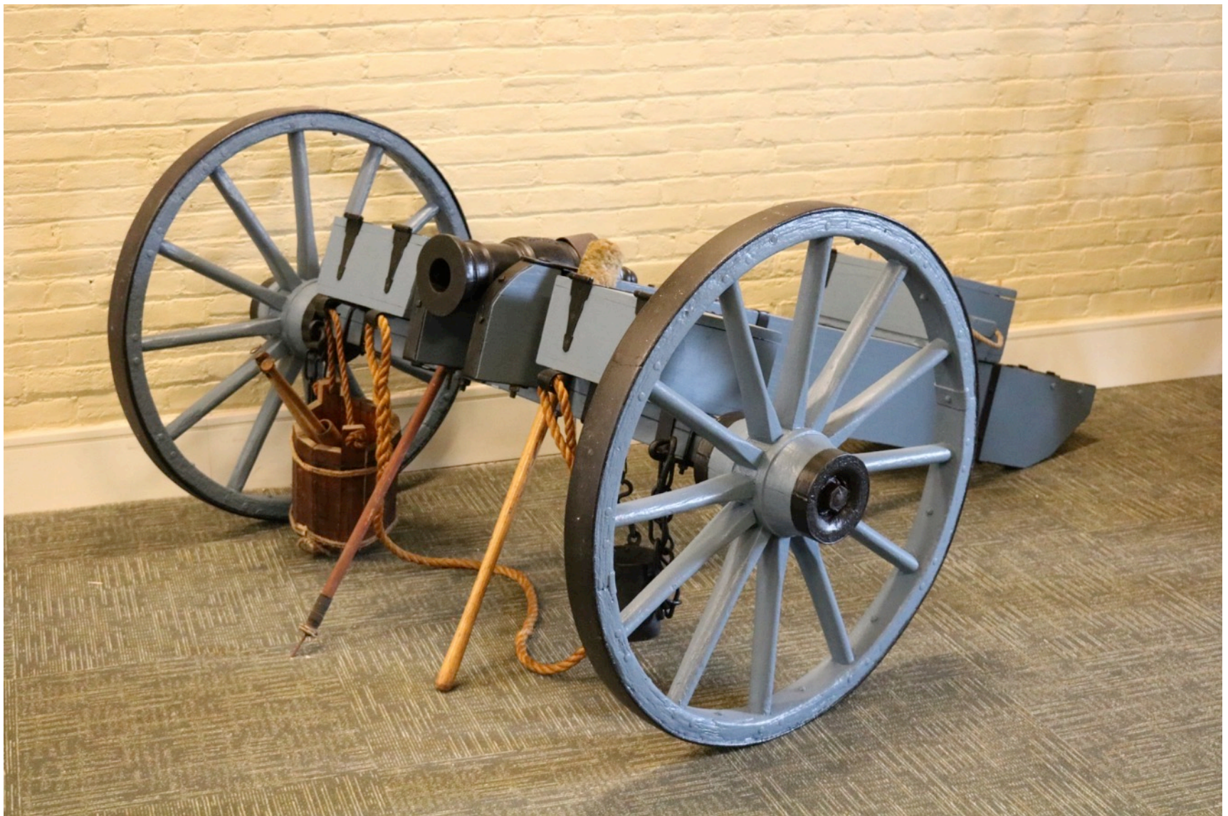
Reproduction Circa 1760 Gilpin Howitzer SAR Museum Board Purchase