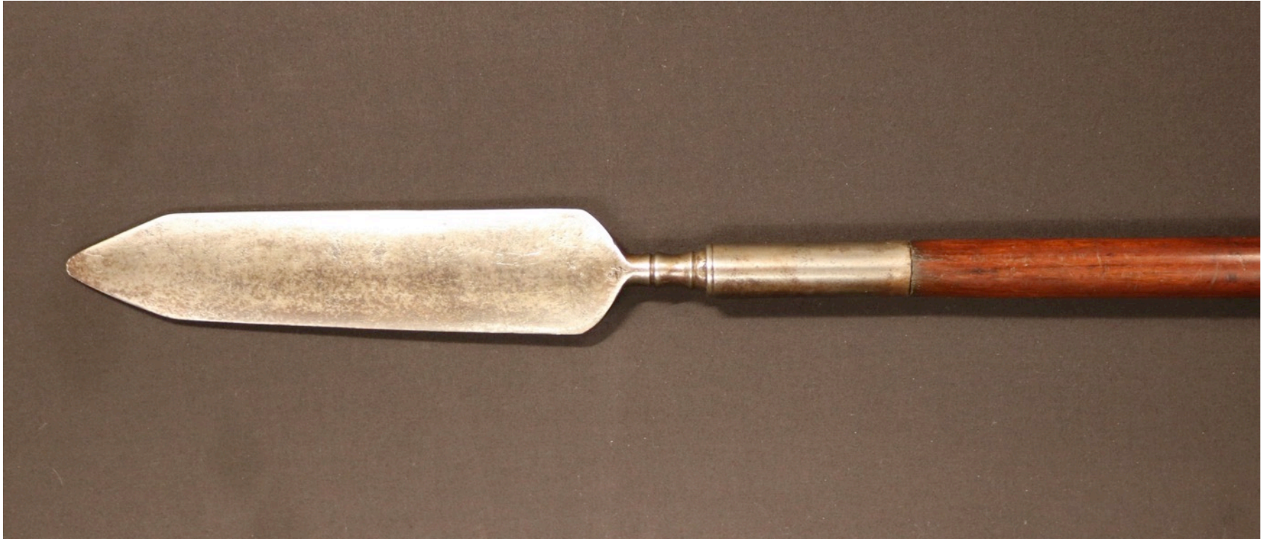
American Revolution Era Spontoon SAR Museum Board Purchase