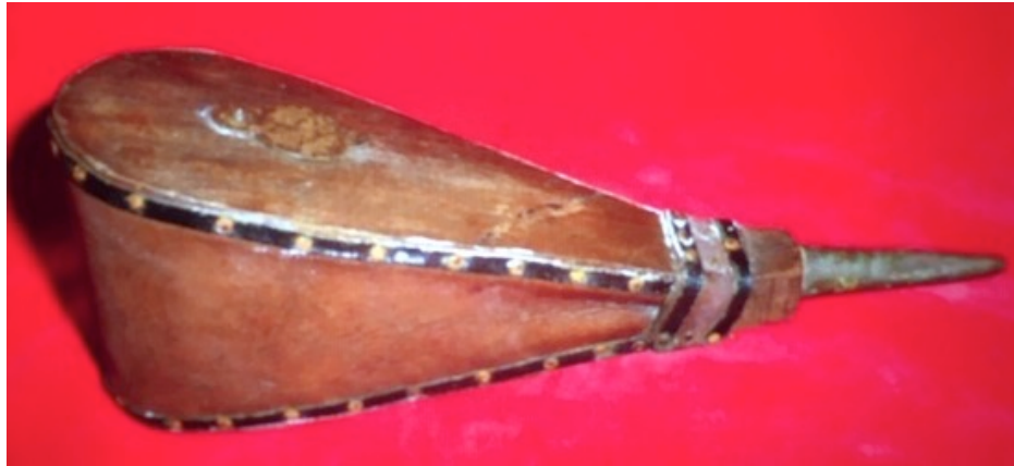
18 th Century Wig Duster