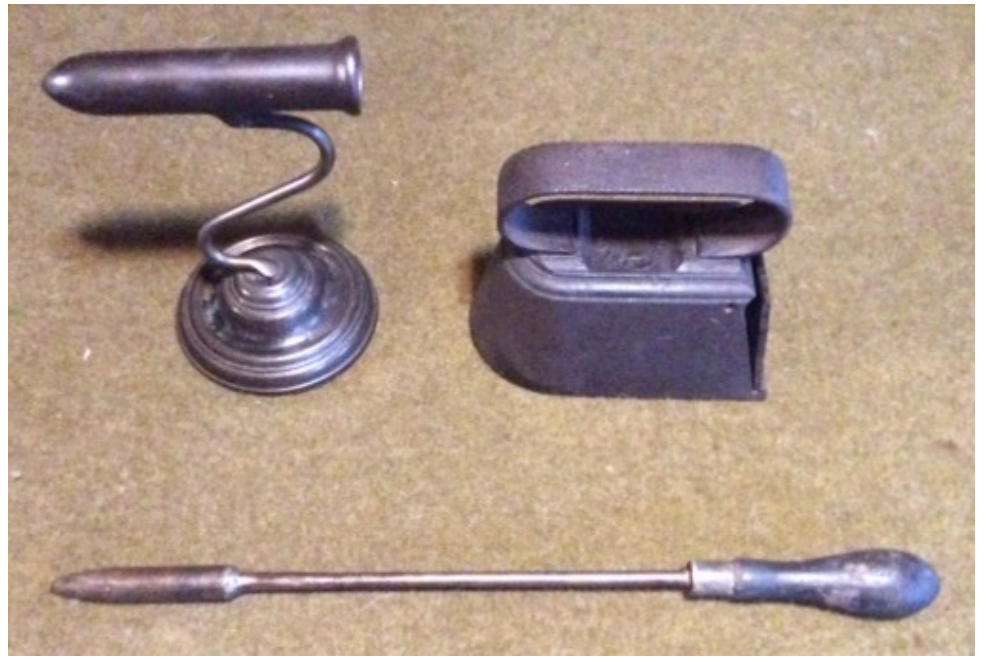
18 th Century Cloth "Gophering" Iron and Iron