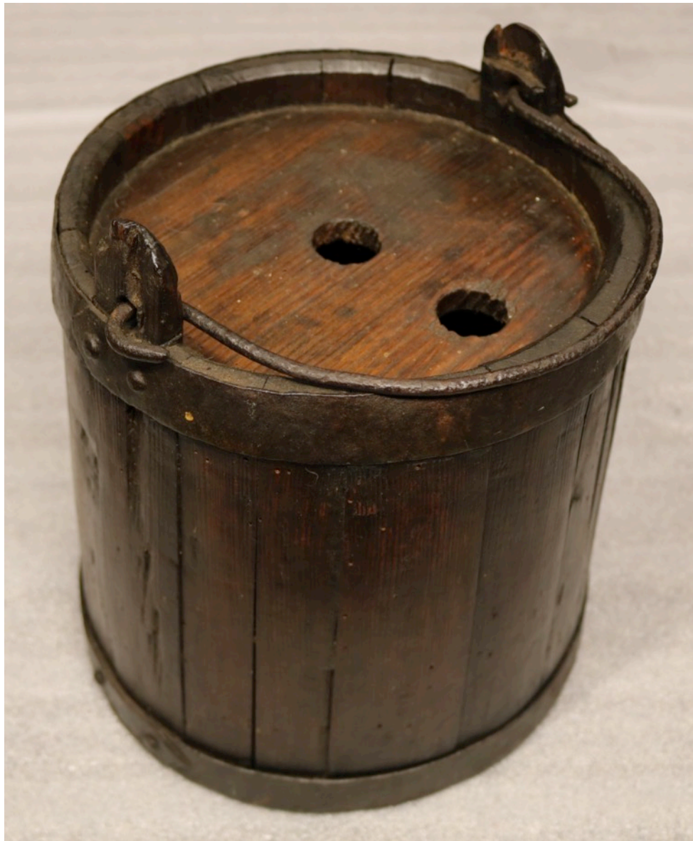
American Revolution Era Wooden Camp Bucket SAR Museum Board Purchase