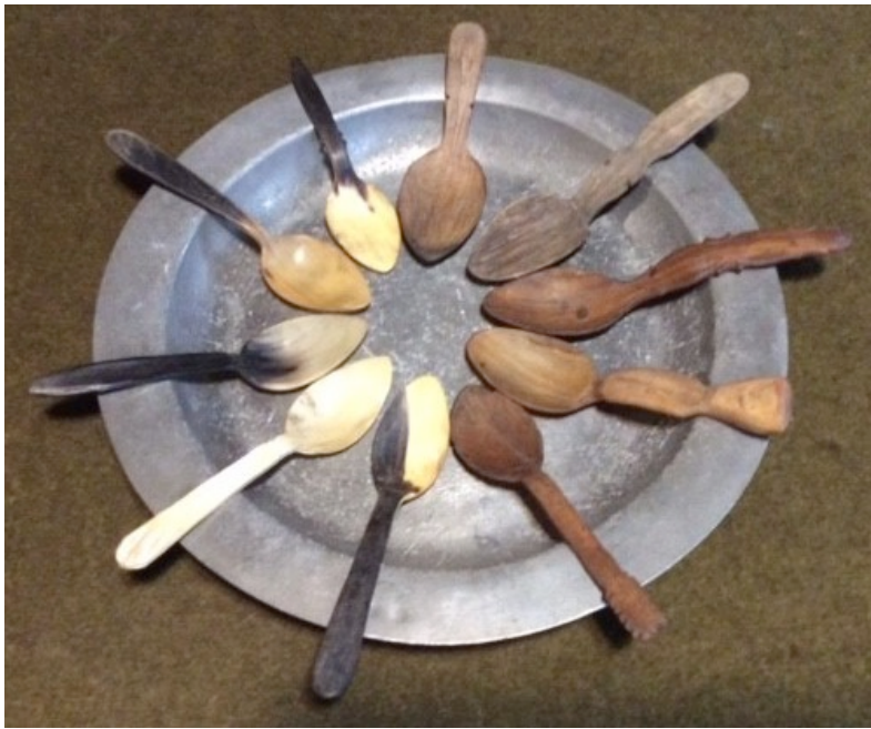
14" Pewter Platter and Ten Spoons of Wood, Bone or Horn