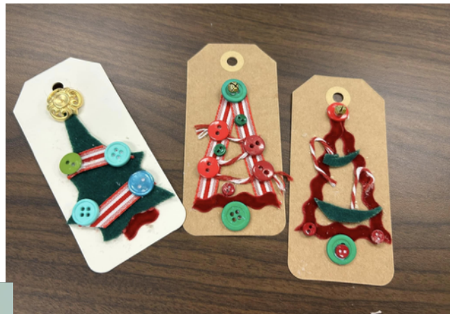
Photos from our fun Nov. 1 Make and Take Meeting