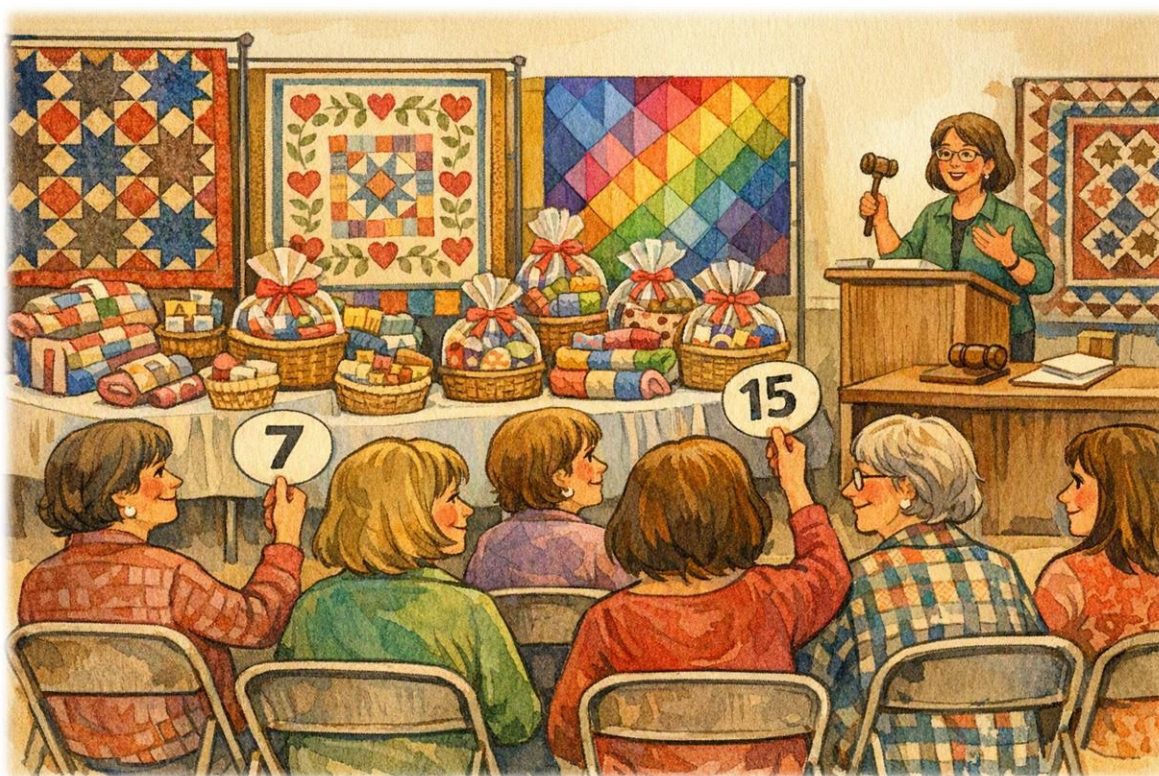
AI Generated Image

Interested in helping out? Contact Jane McAfee. Contact information on page 16.