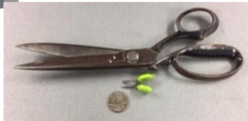
The small and the large from her scissor collection.