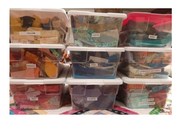
"Inspiration Trunk Show" Candace Hassen Friday, March 4 - 1:30 - 3PM

Bring your old and new scrap quilts for Show & Tell. There will be a "Scrap Swap" - oodles of organized scraps for the taking. Optional: bring a <u>labeled</u> (as to size, color, shape, etc.) quart sized bag(s) of scraps you don't want and you can have first pick of scraps!