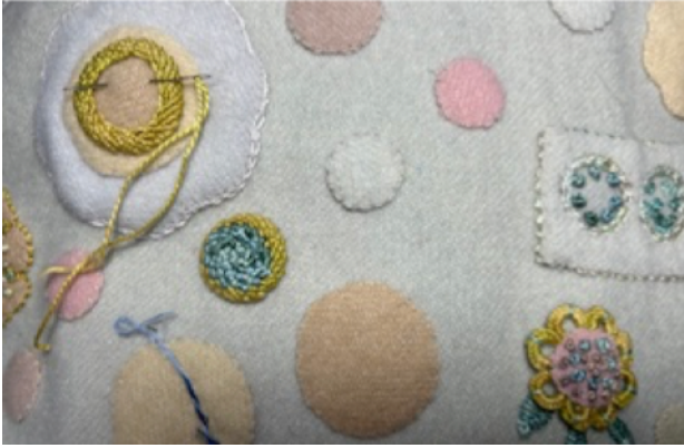
Photo of Karen's stitching on the Tranquil Garden needle roll by Sue Spargo. (Pattern and kit available on Suespargo.com )

Slow Stitching will resume on Friday, August 2, at 10:00 am. We will skip meeting in September because the Lisa Thorpe workshop will be happening during this time.