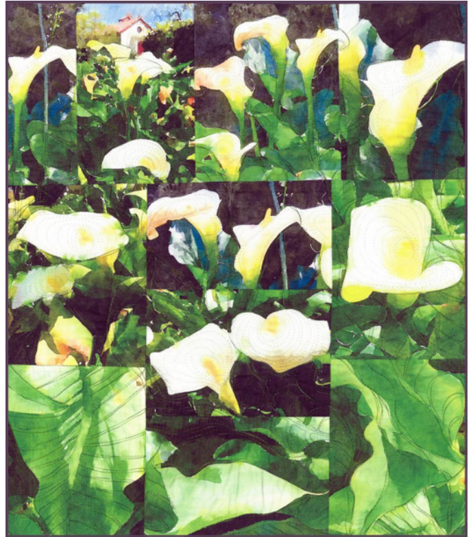
Example of Lisa Thorpe's photo to fabric for “Design in the Palm of Your Hand” Friday, September 6

Lisa Thorpe will demonstrate how to take a simple photo with your smart phone or tablet, manipulate it in an app and print the image onto fabric on a home printer. She will share a variety of art quilts created with these images as a central theme, as well as several art quilts using multiple photo images tiled together to create a stunning collaged quilt effect. Handouts detailing apps, printer info and fabric printing sources provided. There will be lots of art quilts, fabric and clothing items to see. You can play along, download the app and start manipulating photos during the presentation!