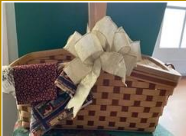
Longaberger Picnic Basket Filled with Fat Quarters

Candace Shively made these 2 lovely Journal covers - just perfect for Holiday giving!!