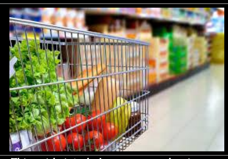
This guide is to help you as you begin your journey into plant-based eating.