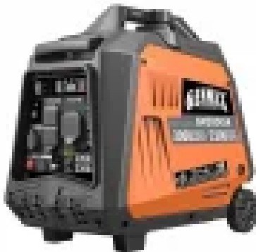
GENMAX GM3000iA 3000 Watt Portable Inverter Generator - CO Sensor