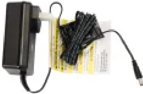
Battery Charging Adapter - EC12