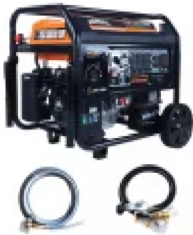
GENMAX GM15000ET 15000Watt Tri-Fuel Portable Generator - 2025 Model with ATS, CO Sensor