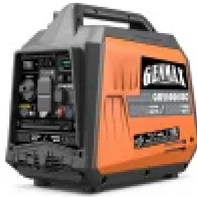
GENMAX GM2800iSAC 2800 Watt Gasoline Inverter Generator with CO Detect