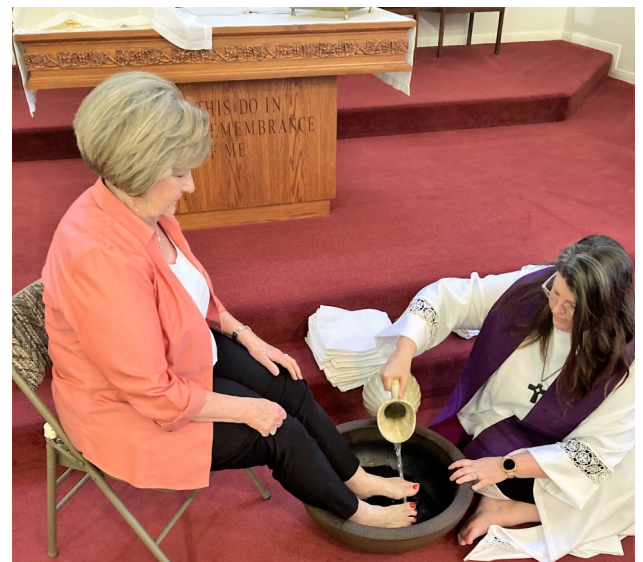
Maundy Thursday Washing of the Feet