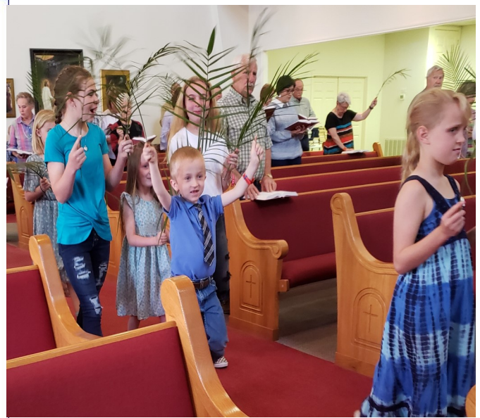
Palm Sunday Smiles !