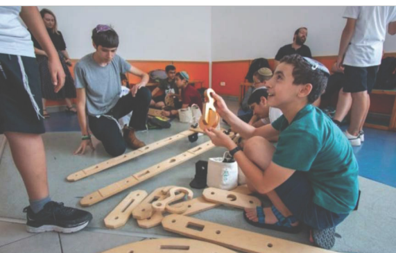
MADATECH Toy Invention Camp

The Meaningful Experiences Program, part of the MADATECH initiative, enhances science education for 5th and 7th graders through interactive projects in science museums. Students explore topics like technological systems, astronomy, and energy engineering, gaining both academic knowledge and 21st-century skills such as problem-solving, teamwork, and innovation. This hands-on approach deepens their understanding of curriculum subjects and prepares them for future careers in science and technology. The program boosts academic performance while fostering essential life skills, helping students to meet future challenges. Its innovative learning model is highly valued for its significant impact on STEM education and personal development.