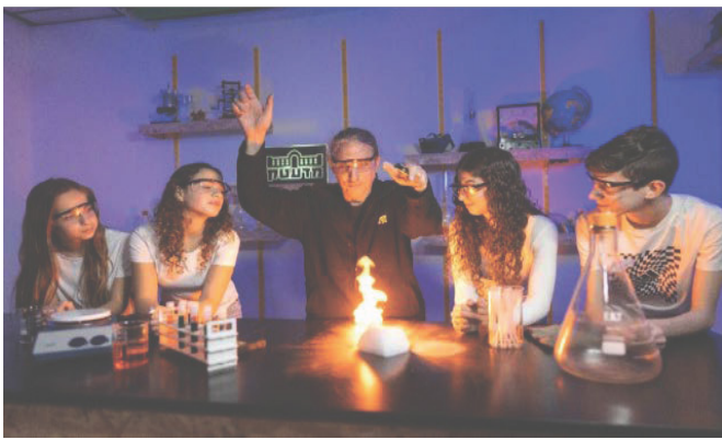
Meaningful Experiences STEM Program