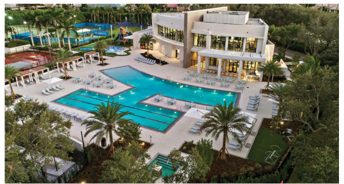
Boca Grove Pool & Facilities