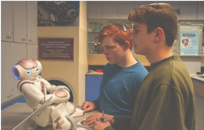
Robotics and Digital Technology Center