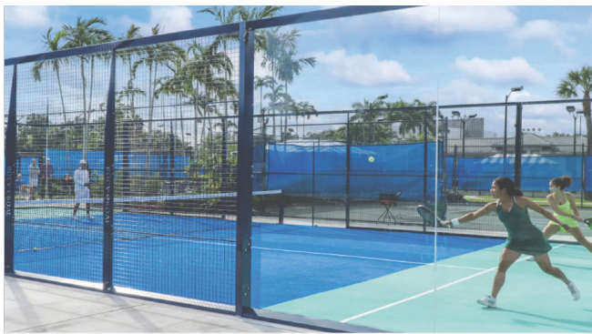
Boca Grove Courts

Don't miss this exciting fundraiser for the DMH Foundation! Information for lodging options and specific details will be coming soon!