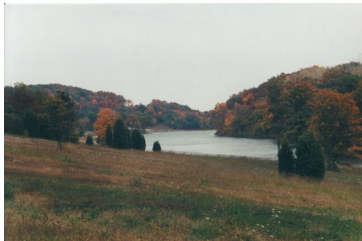
Hickory Lake - 1999