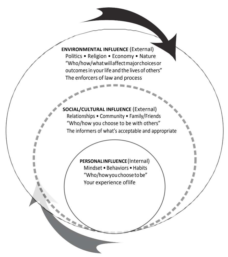
The Social/Cultural Influence (External) Relationships • Community • Family/Friends "Who/How You Choose to Be with Others" The Informers of What's Acceptable and Appropriate

The Social/Cultural Influence sphere lies right outside the personal influence experience. It includes family, friends, social, and work circles as well as communities you choose to rely on and trust (such as religious or philosophical groups or the place you choose to live/work or your career itself). In the Social/Cultural sphere of influence you have some choice, some free will.