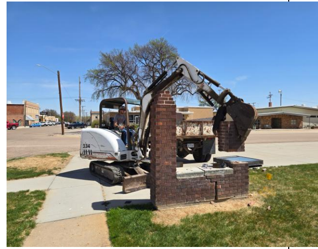
The old brick marquee coming down before it fell. Notice the large crack in the base. Bob Roberts tried to save it years ago but time took its toll! Watch for the update next month....