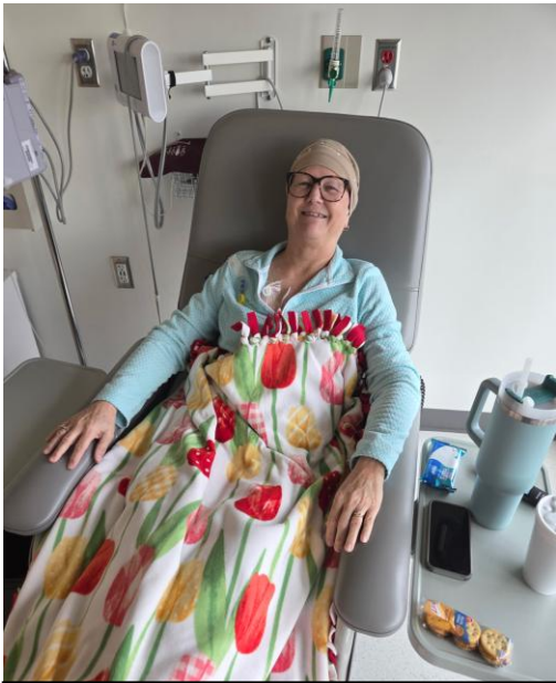
Prayer blankets at work! Our prayer is for your health and healing!

Romans 12:12 Rejoice in your hope, be patient in tribulation, be constant in prayer.