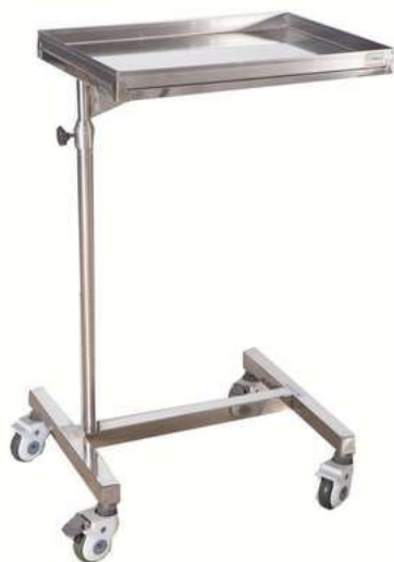
Mayo Trolley | FT08