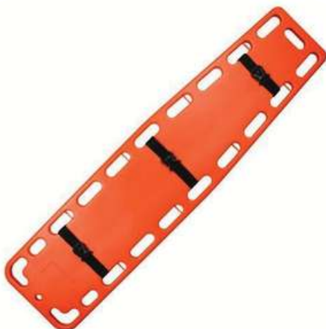
Spine Board | FS10