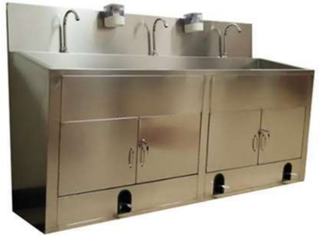
Scrub Station (Foot Operated) | FG09