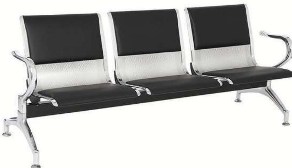
PU Waiting Chair | FSE08