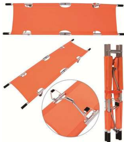
Foldable Stretcher | FS09