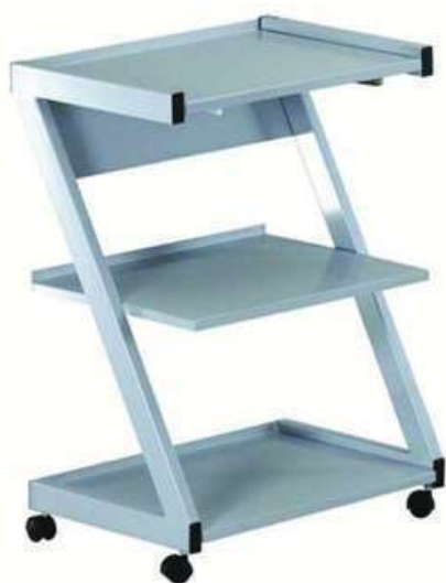
Z Shaped Trolley | FT12