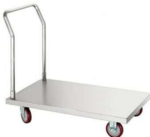
Platform Trolley | FT11