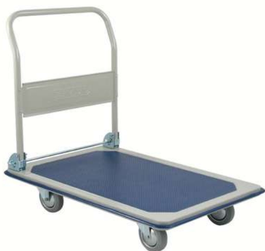
Transport Trolley | FT10