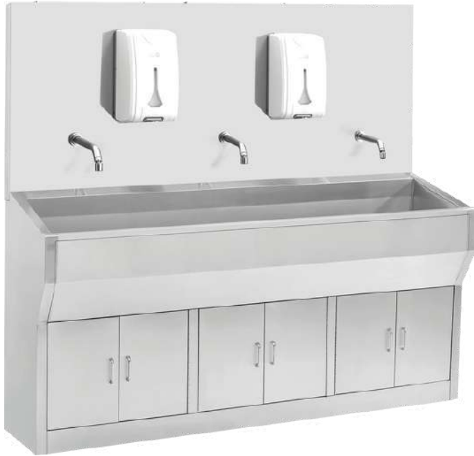
Scrub Station (Sensor Operated) | FG08