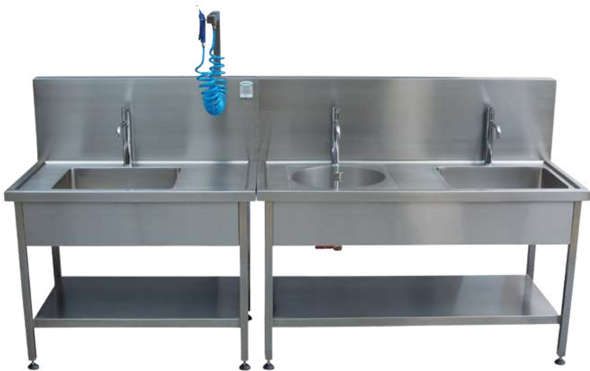
CSSD Scrub Station | FG13