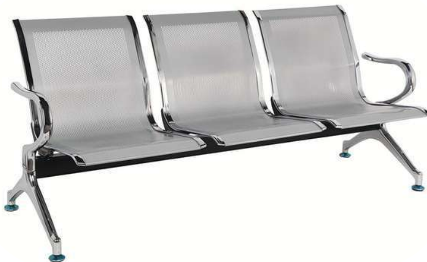
Three Seater Cushion Chair | FSE07