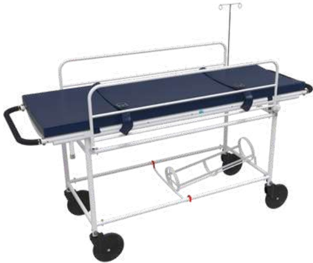
Stretcher on Trolley | FS06