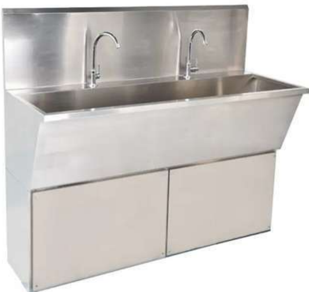
Scrub Station (Elbow Operated) | FG10