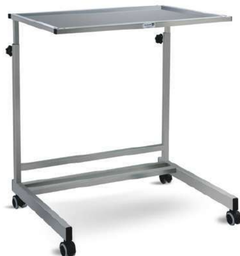
Double Stand Mayo Trolley | FT09