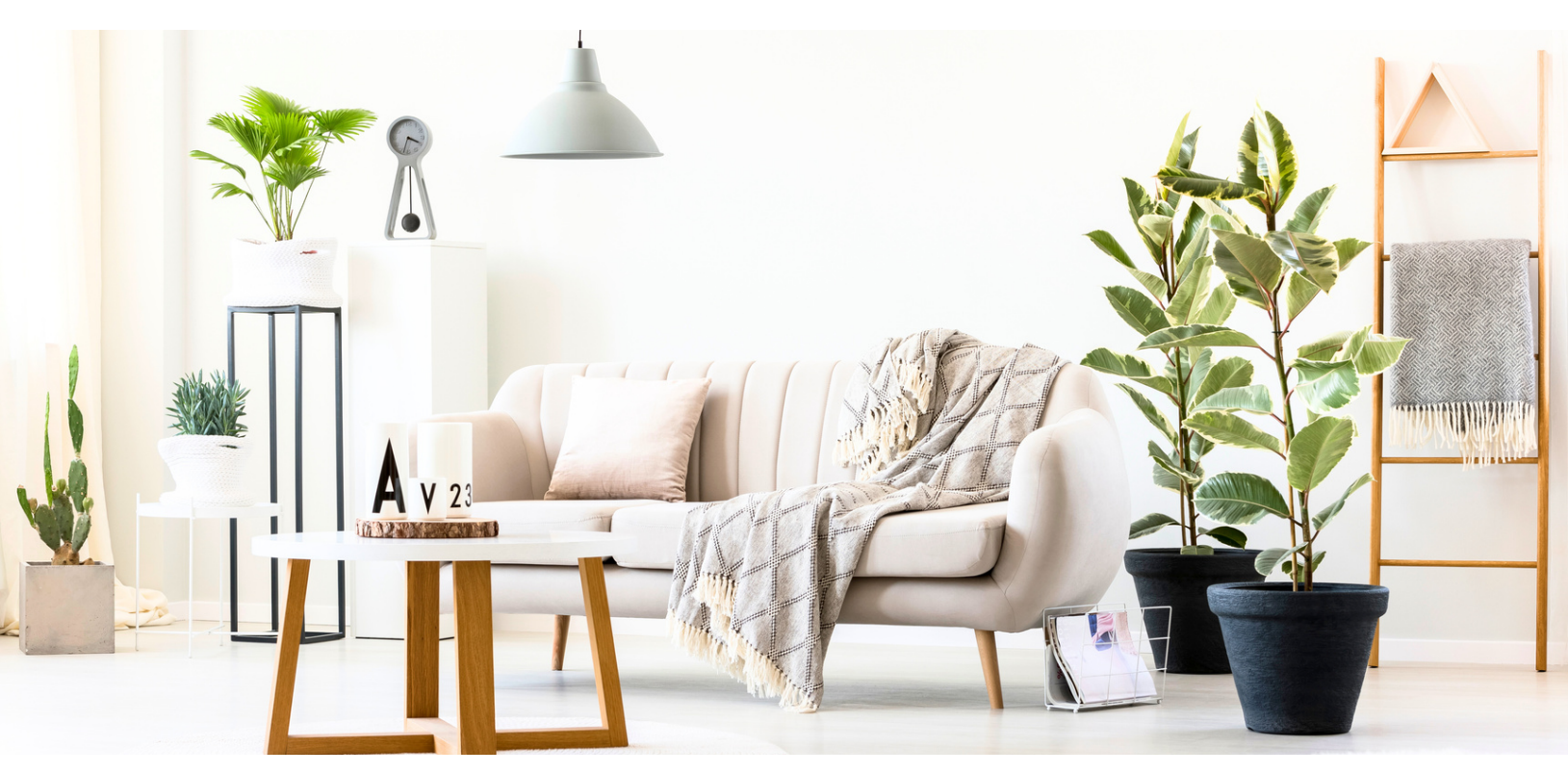
This guide is designed to empower first-time homebuyers in confidently and seamlessly discovering their new home!