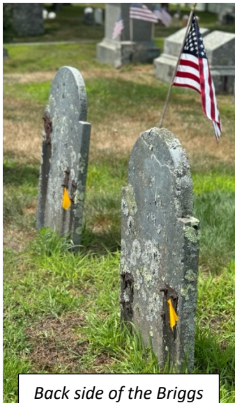
Back side of the Briggs stones showing the old iron strapping.

2 slate headstones: These stones have old iron repairs that are destroying the stone by rusting. Each will be removed from its current setting and the iron straps will be removed, they will be cleaned and the break areas will be repaired with a 2 part commercial epoxy, then the stones will be reset with a new foundation of compacted stone dust.