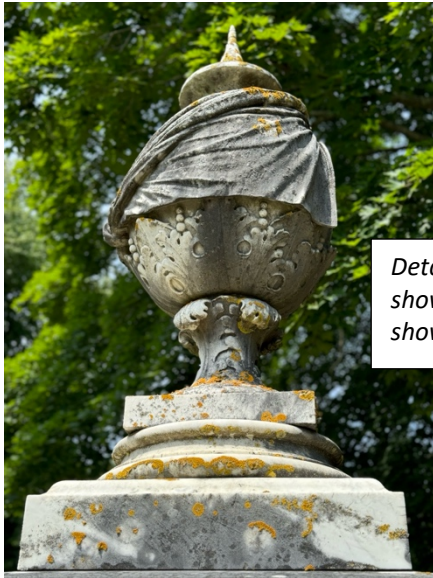
Detail of Torrey monument shown at left, full plot shown at right and below.

1 large marble monument: This 8-piece monument needs to be cleaned and the cracks need to be filled. ($2,000)