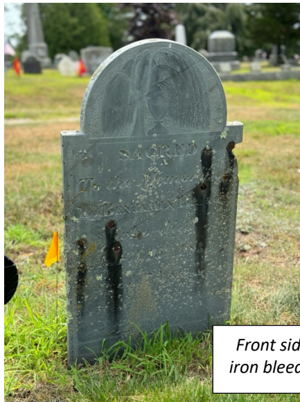
Front side shows the iron bleeding through.