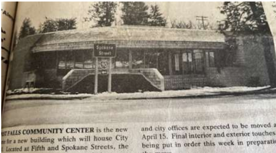
POST FALLS COMMUNITY CENTER is the new building for a new building which will house City offices. Located at Fifth and Spokane Streets, the and city offices are expected to be moved on April 15. Final interior and exterior touches being put in order this week in preparation for the move. The first constructed City Hall at 5 th and Spokane Street was labeled the Post Falls Community Center. (CDA Press, June 30, 1984.)

Kent Helmer served our town when Post Falls had a population of 5,700.