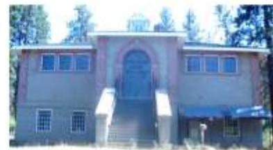
Right: The historic schoolhouse today