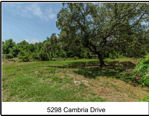
5298 Cambria Drive