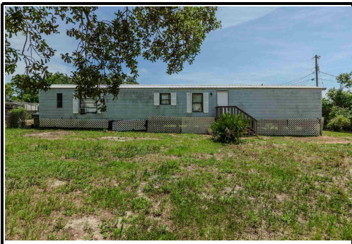
5300 Cambria Drive