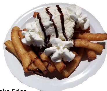
Funnel Cake Fries