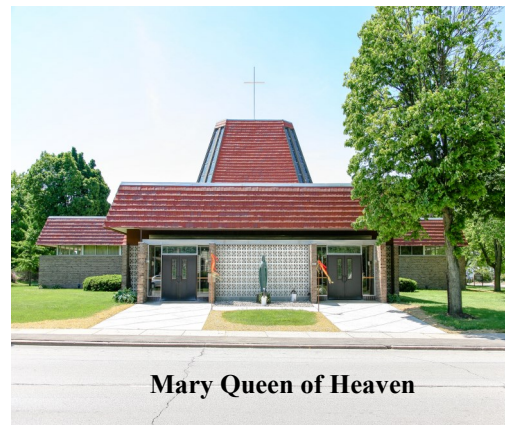
Mary Queen of Heaven