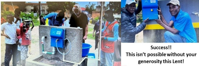
Success!! This isn't possible without your generosity this Lent!