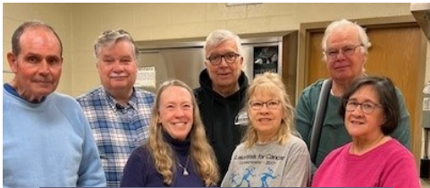
A few of the regular sandwich makers, donors, & bag assemblers

We invite you to join our Pickleball event