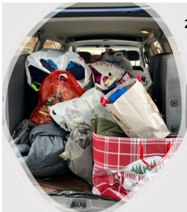
2+ Minivans of New Coats were delivered thanks to our parishioners' generosity!