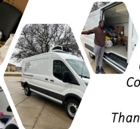
Capuchin Community Services Thanks MPH!!