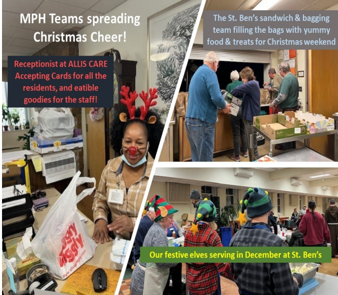
MPH Teams spreading Christmas Cheer!