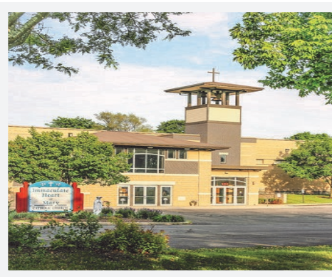
116TH STREET SITE 1212 S. 117th Street