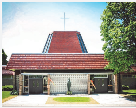
106TH STREET SITE 2322 S. 106th Street