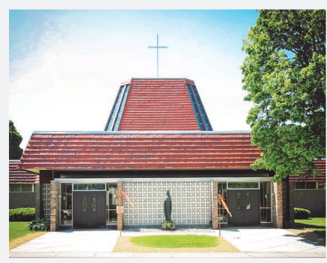
106TH STREET SITE 2322 S. 106th Street