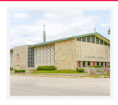
92ND STREET SITE 1414 S. 92nd Street