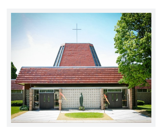
106TH STREET SITE 2322 S. 106th Street