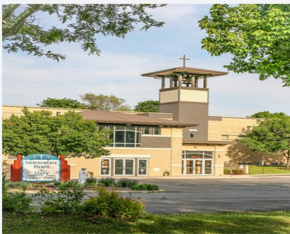
116TH STREET SITE 1212 S. 117th Street