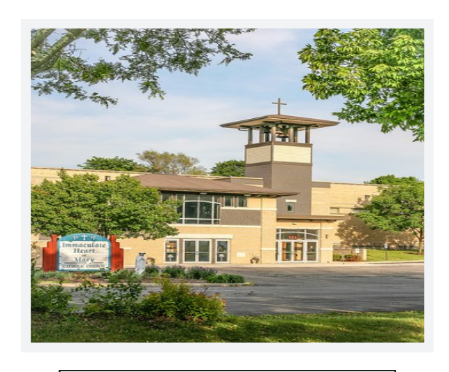
116TH STREET SITE 1212 S. 117th Street