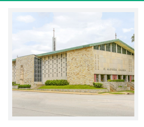
92ND STREET SITE 1414 S. 92nd Street