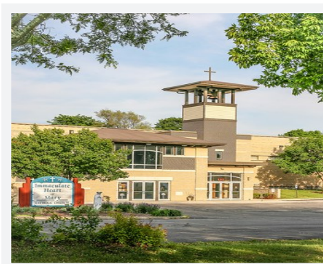
116TH STREET SITE 1212 S. 117th Street