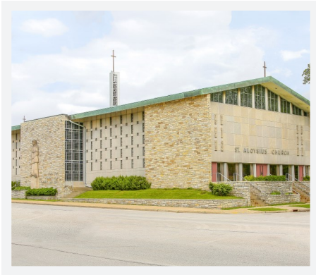
92ND STREET SITE 1414 S. 92nd Street