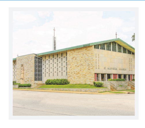
92ND STREET SITE 1414 S. 92nd Street