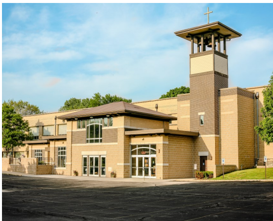
MPH WEST 1212 S. 117th Street